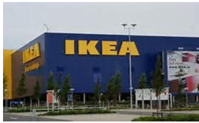
(Trade mark of IDEEA)